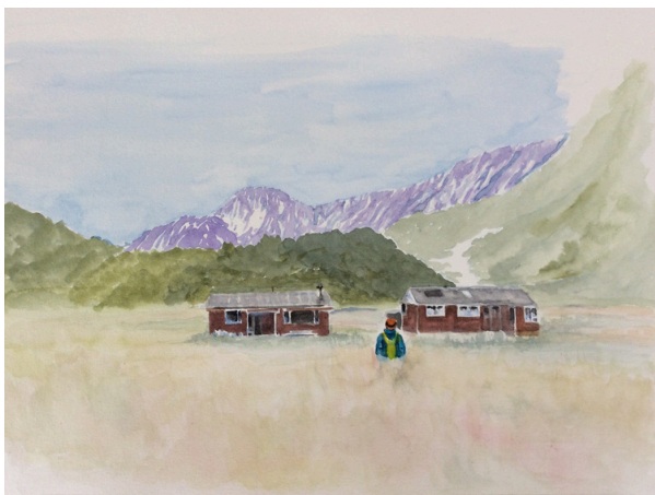
View of Wyn Irwin and Thar Lodges from Foliage Hill ● Aoraki Mount Cook National Park

Media: watercolours and ink Size 395mm x 285mm (w x h)