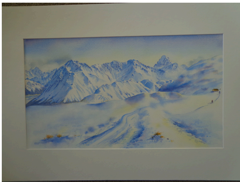
Ski Touring - Rex Simpson Hut, Two Thumbs Range ● (watercolour)