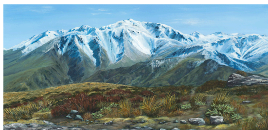
The Winterslow Range ●