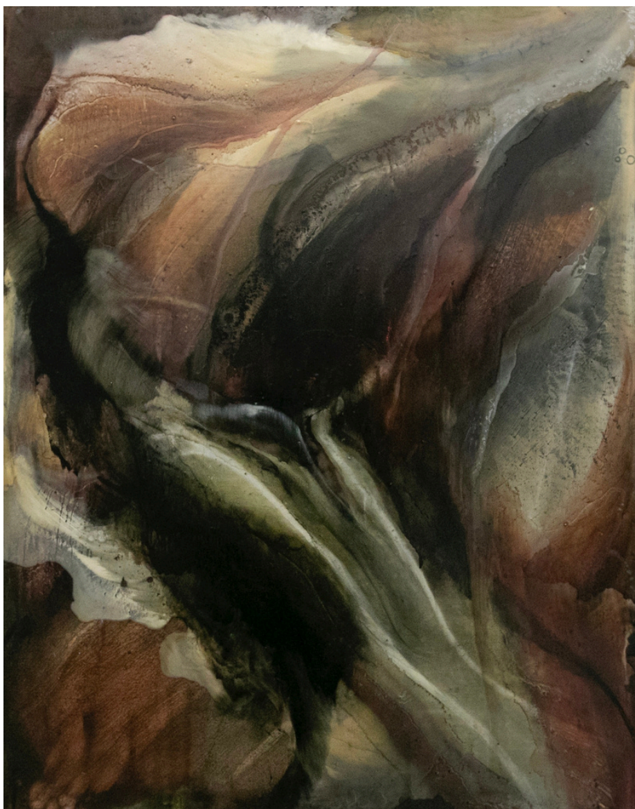
Wind Cinder ●