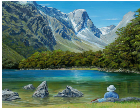
On The Road To Roundhill ●