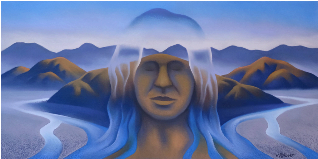
'Kaitiaki', Augmented Limited Edition ●