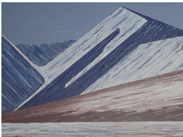
Hut Range from Tin Hut, Cass Valley ●