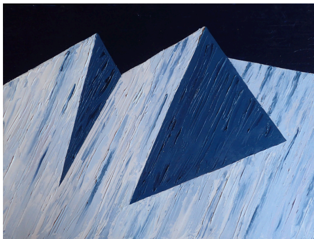
Aigrette from Centennial Hut ●