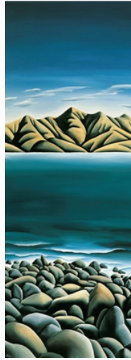
Limited edition prints