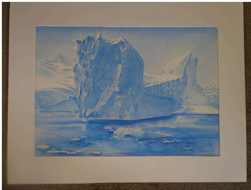
Icebergs, Whitemena Passage, Antarctica ● (watercolour)