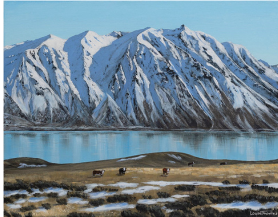
Lake McKenzie ●